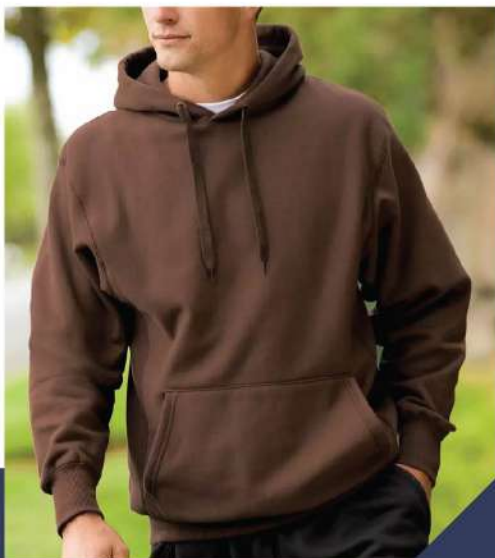
HOSIERY/ KNITTED GARMENTS